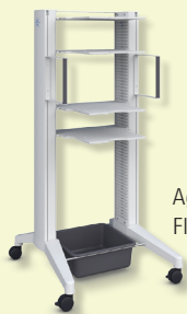
Agilent A-Line Flex Bench Rack