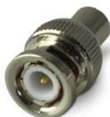
BNC-50J short circuit plug, G4383-40000