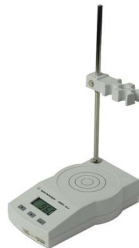
3200SA stirrer, G4388A

*EC Print software for easy and direct printing and EC Firmware software are available for free download at www.agilent.com/chem/phmeters