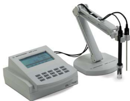
3200I ion meter, G4386A