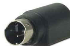
Conductivity diagnostic tool, 5185-8391