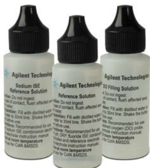
Agilent reference and filling solutions