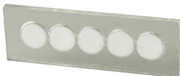
Ammonia electrode membrane, 5190-0543