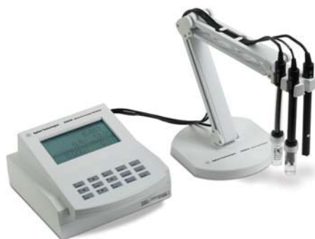
3200M multi-parameter meter, G4387A