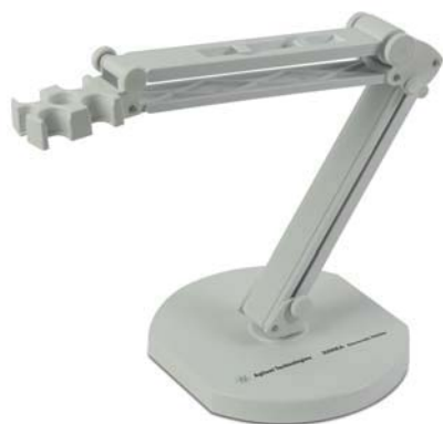
3200EA electrode holder, G4389A

Unlike single-layer breathable membrane electrodes, Agilent electrodes are made from multi-layered composite materials for extra durability. They also feature a specific barrier to protect the glass bubble against breakage.