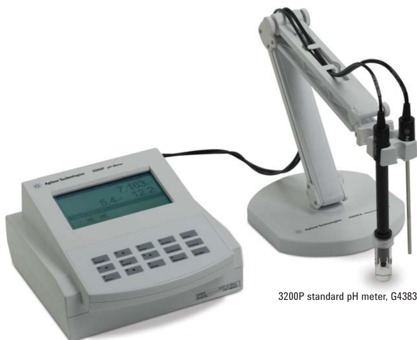
3200P standard pH meter, G4383A