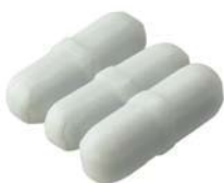
B620 stirring bar, G4388-27000