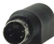
ATC temperature diagnostic tool, 5185-8390