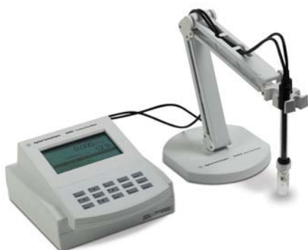
3200C conductivity meter, G4384A