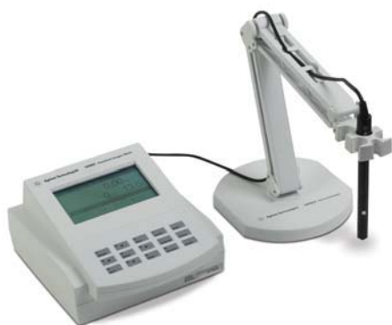
3200D dissolved oxygen meter, G4385A